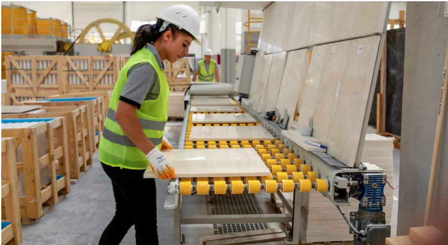
The cut to size materials are manually selected, one by one, according to the reference samples. We constantly produce Burdur Beige in standart sizes and also special sizes in different colors according to the project requirements.